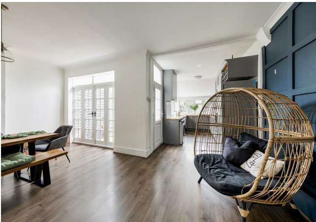
Reception Room 16'10" x 12'5"